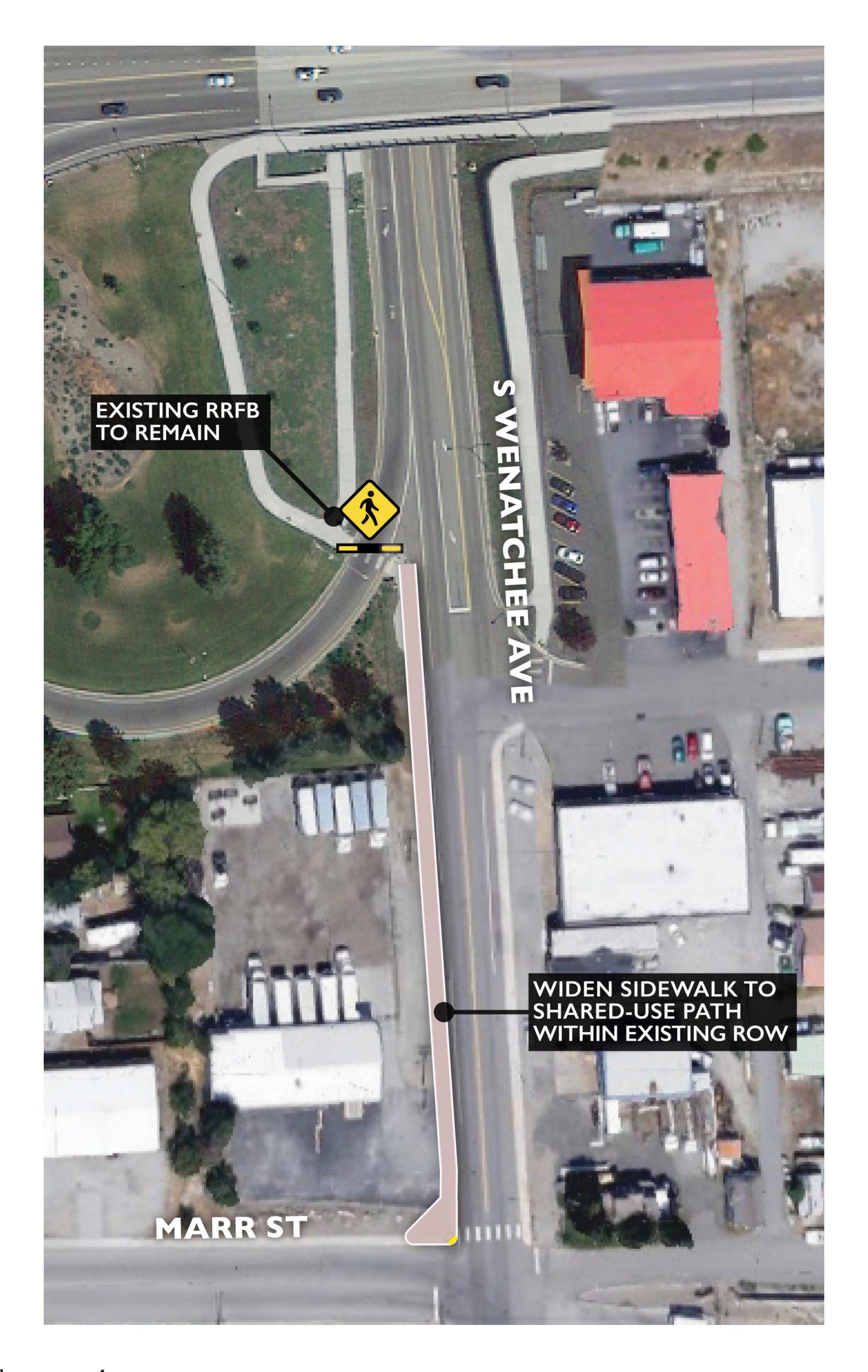
Figure 4 Shared-Use Path South of Snohomish Street