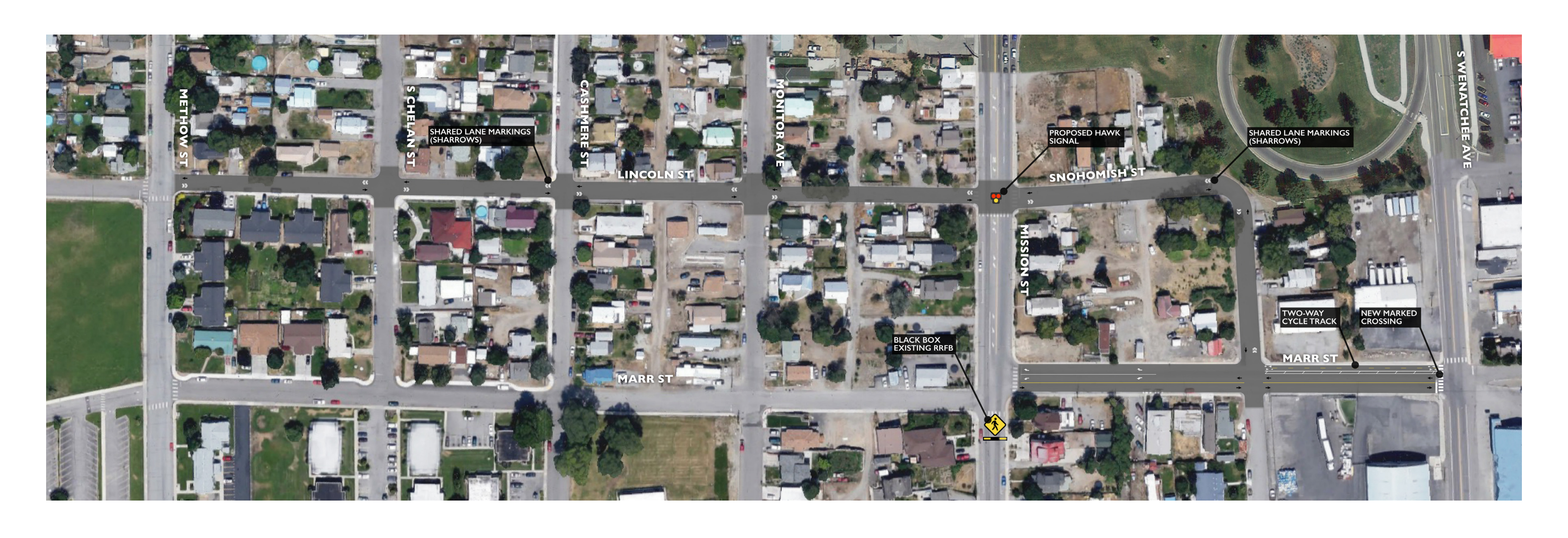
Figure 8 Lincoln Street