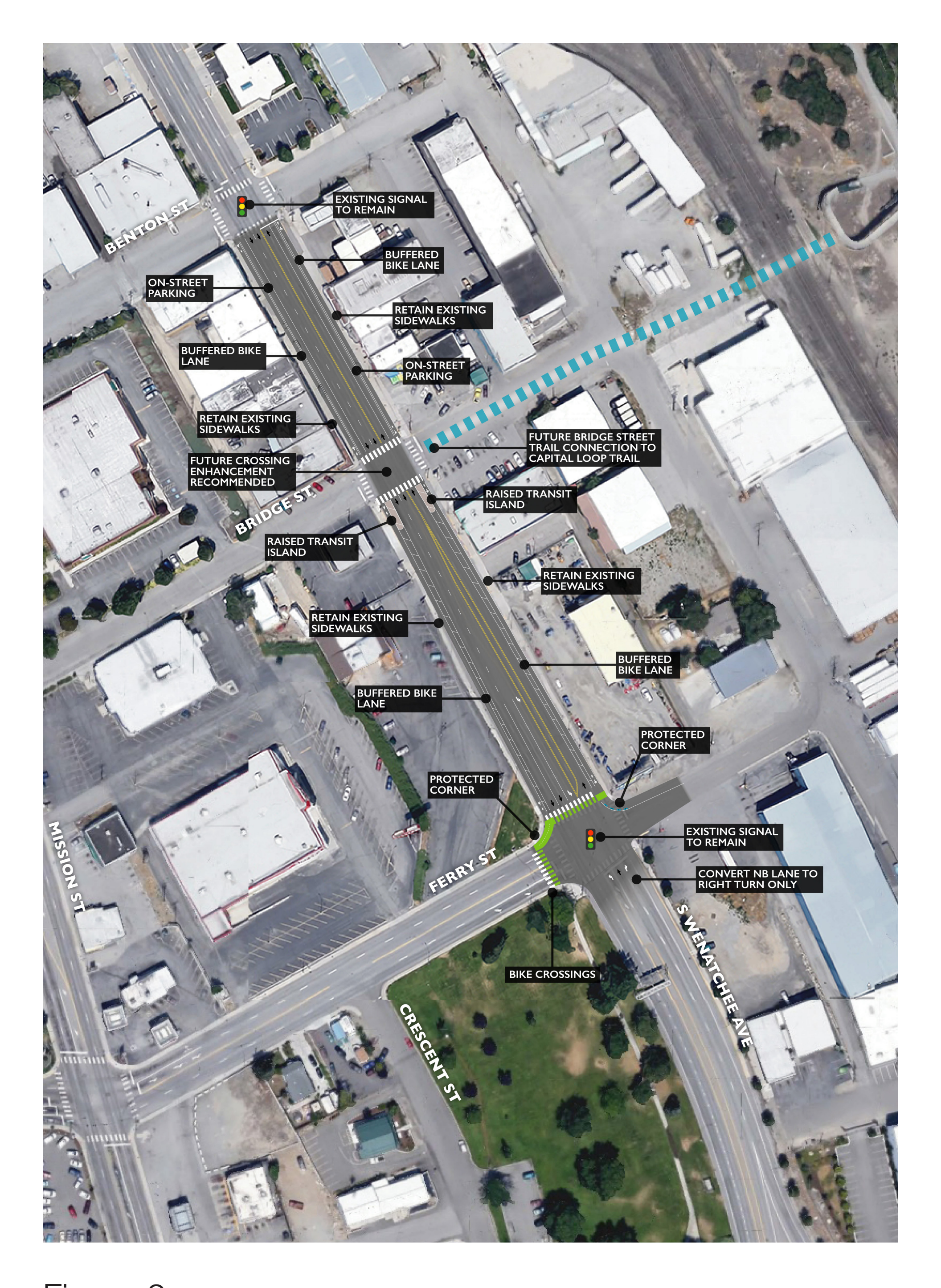
Figure 2 Buffered Bike Lanes