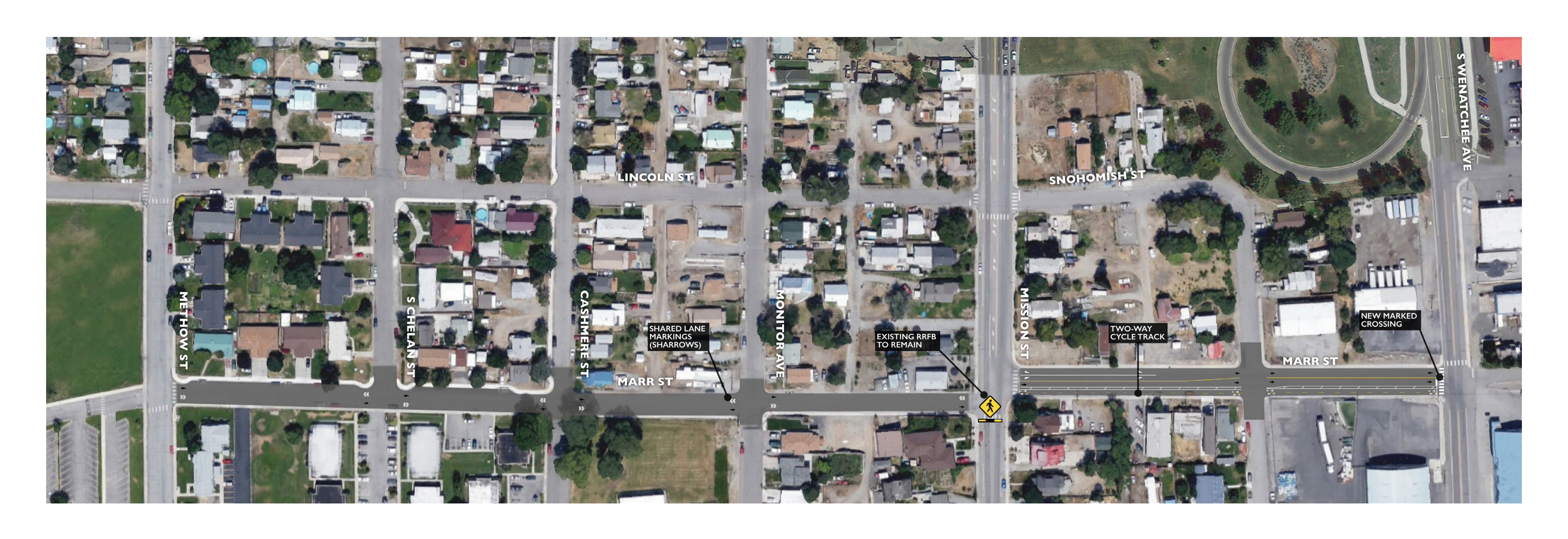
Figure 9 Marr Street