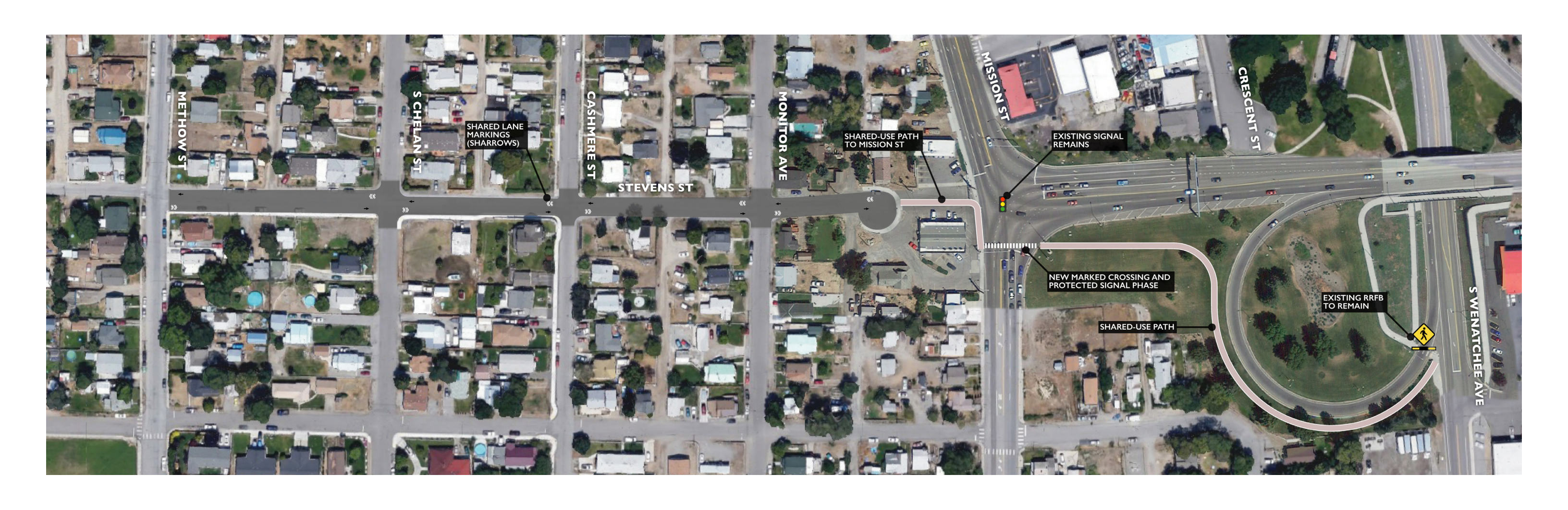
Figure 7 Stevens Street