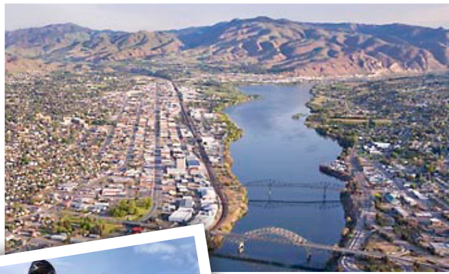
The Wenatchee Valley